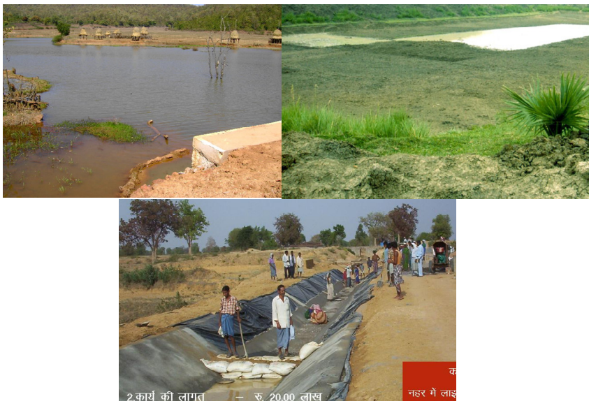
Figure 4: Works in progress under NREGAS